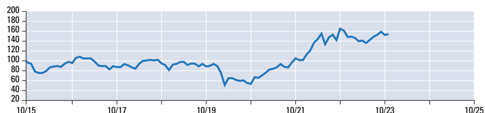
— Goldman Sachs North America Energy & Energy Infrastructure Equity Portfolio - Class R Shares (Acc.) (EUR) (3)