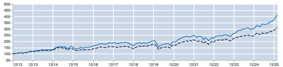
— Goldman Sachs Europe CORE Equity Portfolio - Class R Shares (Acc) (5) - - MSCI Europe (Net Total Return, Unhedged, EUR) (3)

This is an actively managed fund that is not designed to track its reference benchmark. Therefore the performance of the fund and the performance of its reference benchmark may diverge. In addition stated reference benchmark returns do not reflect any management or other charges to the fund, whereas stated returns of the fund do. Past performance does not predict future returns. The value of investments and the income derived from investments will fluctuate and can go down as well as up. A loss of capital may occur.